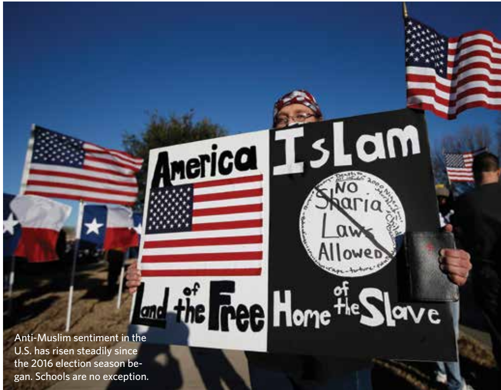
Anti-Muslim sentiment in the U.S. has risen steadily since the 2016 election season began. Schools are no exception.

In Massachusetts, an elementary school social