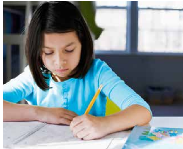
Teachers report their students from immigrant families are anxious about a wall between the U.S. and Mexico and fearful they will be deported.