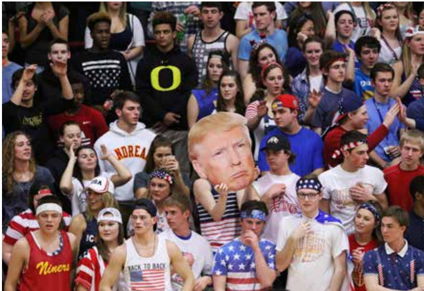
Students in Merrillville, Indiana, found themselves in the news after chanting, “Build a wall!” during a basketball game against a rival team made up of mostly Latino players.

teacher reported, the girl expressed suicidal thoughts.